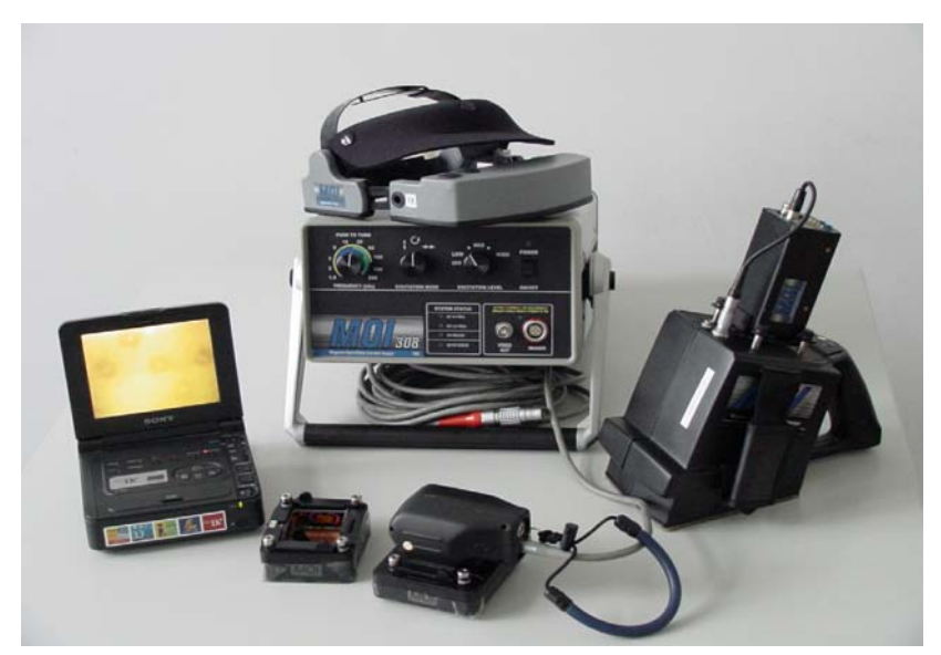
Fig. 2. MOI diagnostic system

The MOI system (Fig.2) – enables very fast assessment of damage developed in rivet connections and hidden corrosion. System operation's ease and result display, as well as collected data archiving capability, enable examining by crash-course trained operators.