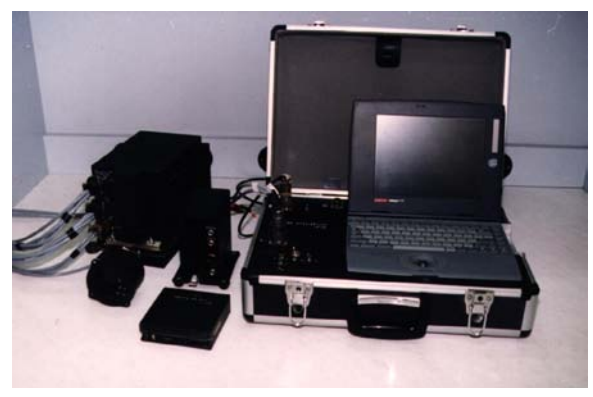
Fig. 3. S2-3a/P recording system for airborne tests

The Institute has been for many ears involved in an effort to upgrade flight performance recording systems, both operating and emergency, and a whole family of airborne test recorders was developed. A system, S2-3ap, was designed and implemented of airborne test recording. The system, compared to earlier recorders (e.g. RPCM4b system), enables measurement of more flight parameters, including those read-out from aircraft data bus. The system is more compact and enables faster adjustment to specific research task (also airborne). The S2-3ap system is currently used by the ITWL Institute for airborne tests.